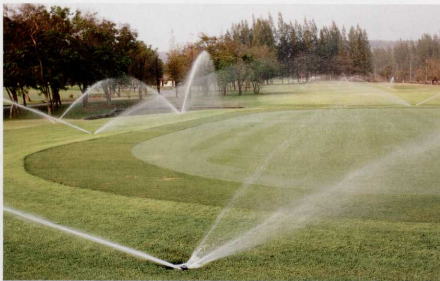
Water quality is one of the most misunderstood parts of any golf course management program.

dividing the ppm values by the milliequivalent weights of each ion. The weights of key elements are Ca = 20 mg/meq, Mg = 12 mg/meq and Sodium (Na) = 23 mg/meq. For example, analysis shows 62 ppm Ca. 62/20 = 3.1 meq/l for calcium.