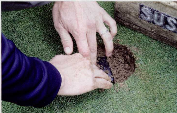
Sensors are placed within the soil profile to monitor moisture.