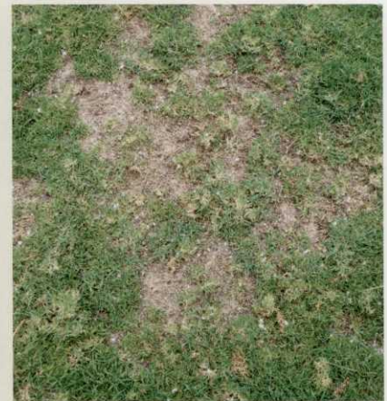
Image 3. As stunting and death of stems and stolons continue, the turf fails to recover from the damage and bare spots begin to appear. The stunted tufts are quite noticeable.

witch's broom symptom (Image 1). Because of their small size, color and habit of feeding under the leaf sheath, individual Bermudagrass mites are extremely difficult to see even with a hand lens. The witch's broom damage is a more reliable diagnostic characteristic.