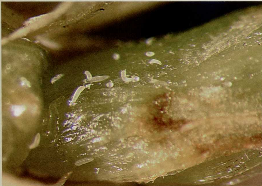
Image 2. Adult Bermudagrass mites are tiny, with a banana-shaped body, two pairs of legs, and a whitish cream or translucent color. Eggs are oval and translucent.