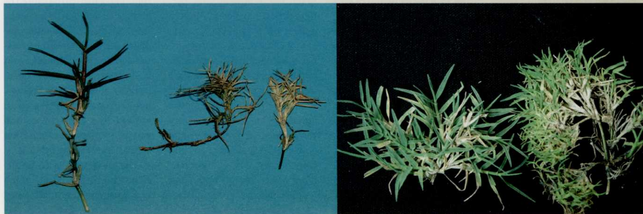
Image 1. Infestation by the Bermudagrass mite stunts stem growth in common and hybrid Bermudagrass, causing the characteristic "witch's broom" symptom in stem (left) and the entire tuft (right).

sentence – banana-shaped body, and two pairs of legs (as opposed to four pairs on typical mites and three pairs on typical insects). The Bermudagrass mite is whitish cream in color or translucent, as seen in Image 2. A large number feed under the leaf sheath, causing stunted internodes and a typical