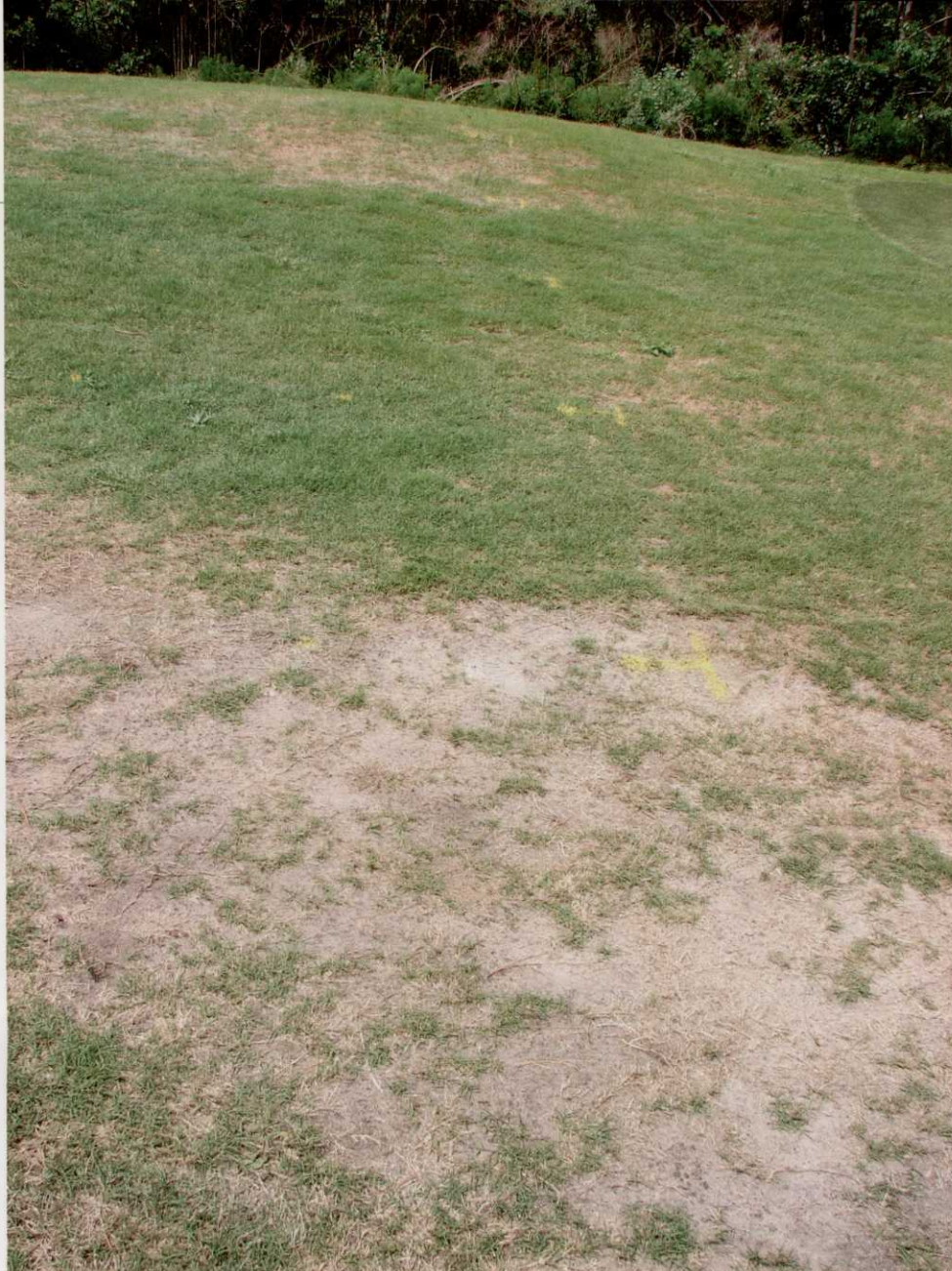
Image 4. As damage continues, the bare spots expand and coalesce, creating a large area of bare soil. The damage appears to be most severe on slopes where water distribution is not even.

4-foot rectangular frame is constructed with PVC pipes. Inside the frame, strings are threaded through holes drilled into the PVC pipes at 1-foot intervals, creating 12 grids. The frame is then placed onto infested turf and the total number of witch's brooms in 10 of the 12 grids is counted. Samples should be taken once a month from every 50 feet on fairways and roughs, four frame samples from each green approach, and two frame samples from each tee bank. If four or more witch's brooms are found in each sample, a chemical control program should