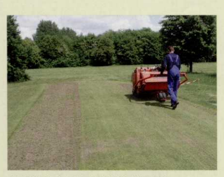
CORE RECYCLER Re-use sand, collect thatch.