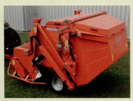
SUPER 600 Verticut, sweeps and more.