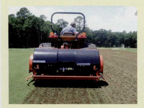
Terra Spike XF Fastest on the market.