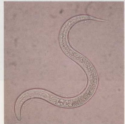
A fungus gnat nematode.