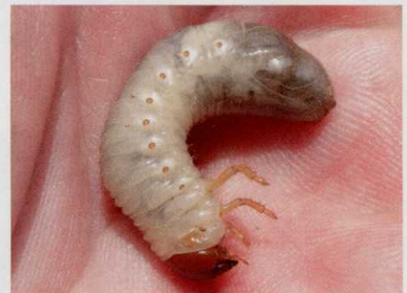
Top: Beneficial nematodes emerge to seek out a new host. Bottom right: In addition to root damage, grubs are a favorite snack of skunks and raccoons. Bottom left: Tiny, but deadly if you're a grub.