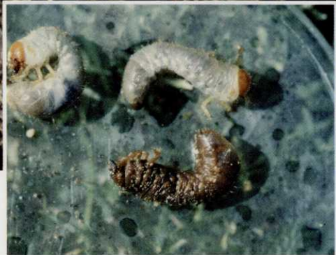
Above: Two white grub larvae killed by Heterorhabditis bacteriophora next to two healthy larvae Left: A white grub larva killed by Heterorhabditis bacteriophora next to two healthy larvae

just as well," she says. "[They] just have to justify the extra cost."