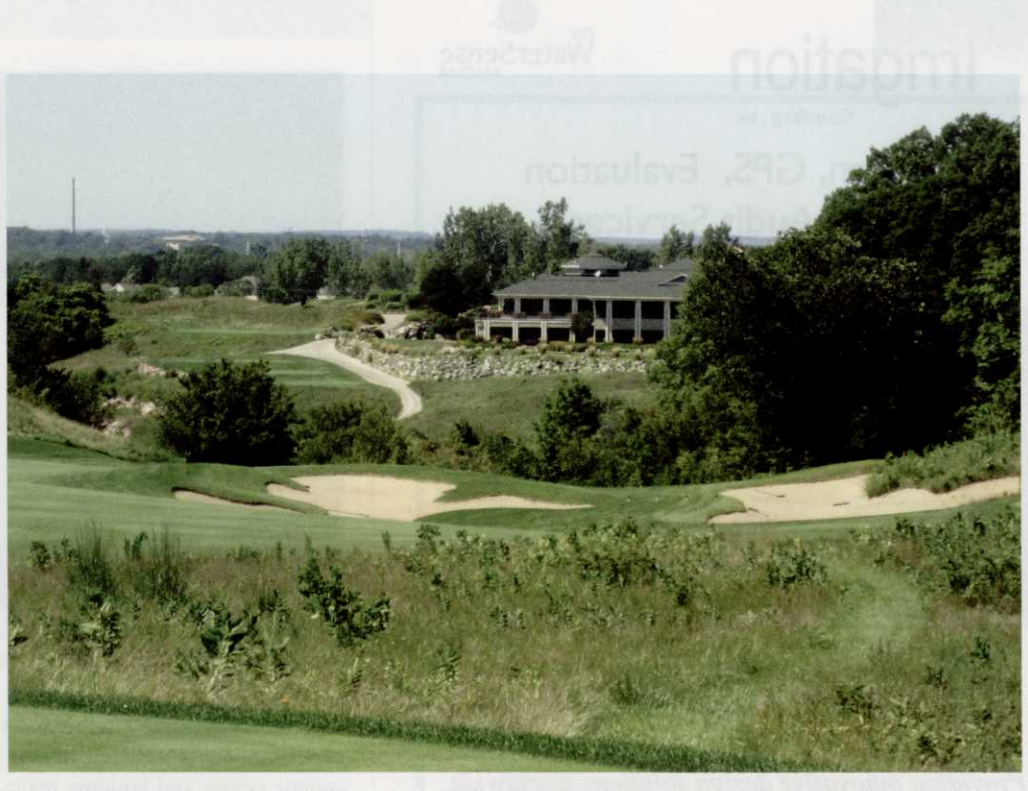
Under Tim Nugent, there have been just a few minor modifications to Green Bay Country Club, including more tees and bunkers.

The trail served as a mail route between Fort Dearborn in Chicago and Fort Howard in Green Bay. In 1832 the trail became an official post road by an Act of Congress. In 1836 the first stagecoach service was initiated