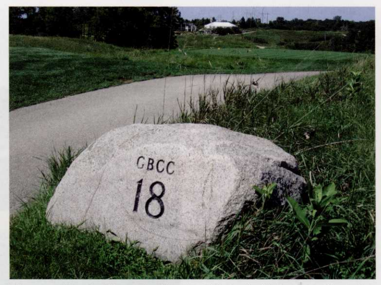
When one tours the Green Bay Country Club the first thing you notice is the attention to detail throughout the property.

ting course is something in most superintendents' skill set but the aquatic center and building maintenance take some additional skills.