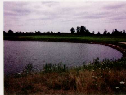
Before treatment and after shots. Some supers treat their water features in-house, while others enlist the services of an outside company.