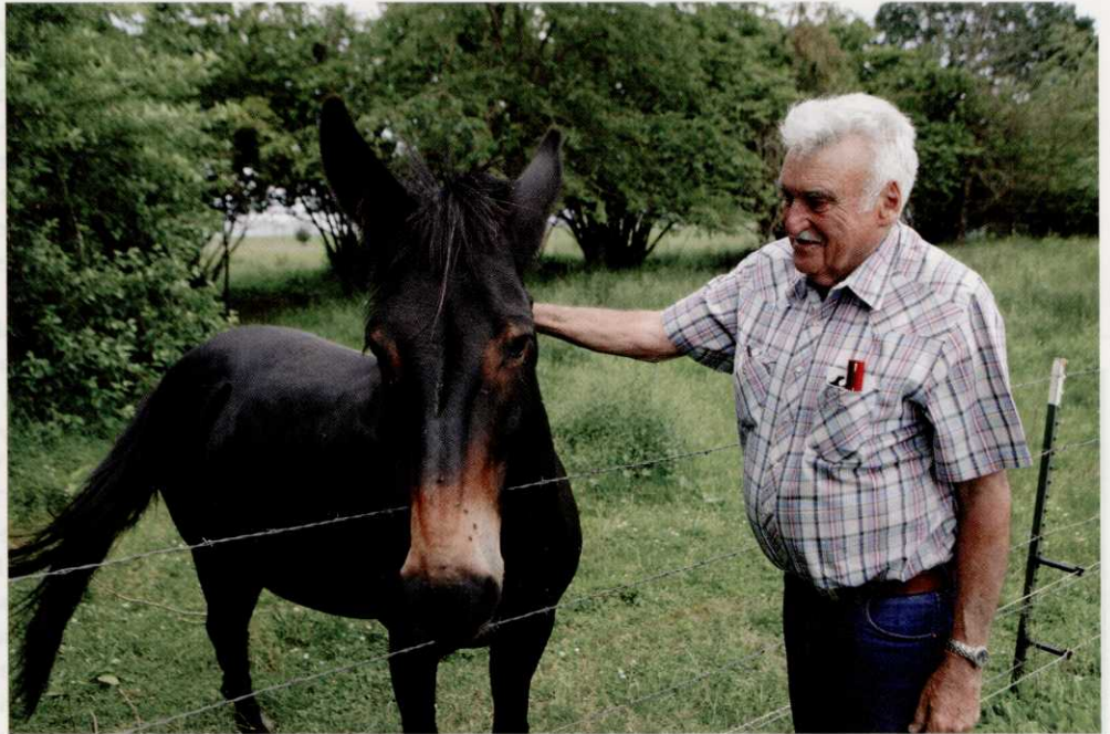
Rose was a strong factor in the development of Penncross Bentgrass, which was often the wall-to-wall turf choice for growing courses at the time.