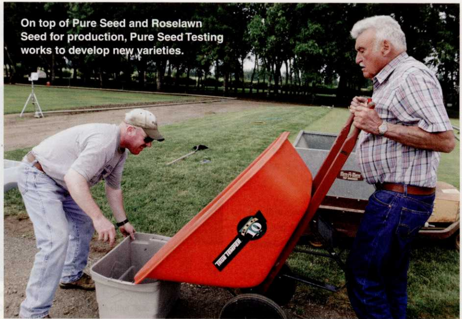
On top of Pure Seed and Roselawn Seed for production, Pure Seed Testing works to develop new varieties.