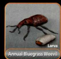
Annual Bluegrass Weevil