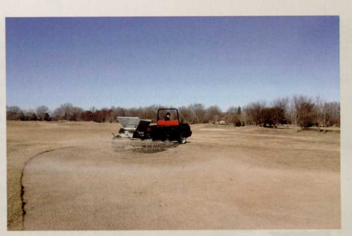
Topdressing is easier and more cost-effective for some courses, but requires a lot of work in cleanup and can leave turf open to damage.