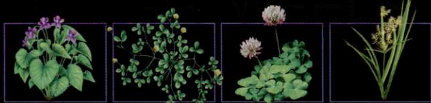
WILD VIOLET BLACK MEDIC CLOVER YELLOW NUTSEDGE (SUPPRESSION)