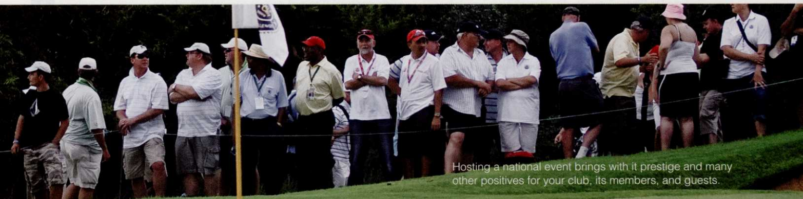
Hosting a national event brings with it prestige and many other positives for your club, its members, and guests.

Do I have to tell you that love can hurt? GCI