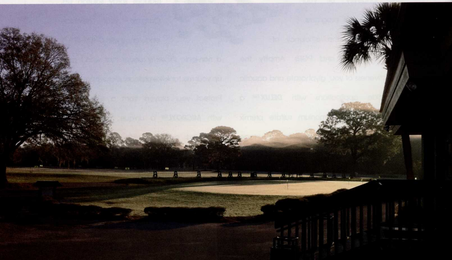
One of the first questions should be to find out if there are any "sacred cows" growing on the golf course.

Trees are planted by well-meaning people and thousands came onto golf courses after the decline of the American Elm in the 1960s. Now those trees are sending their roots into golf greens, tees and fairways. Shade creates issues on greens and can be a causal factor in turf decline. Trees require more than just the cost of planting — they require actual maintenance over time.