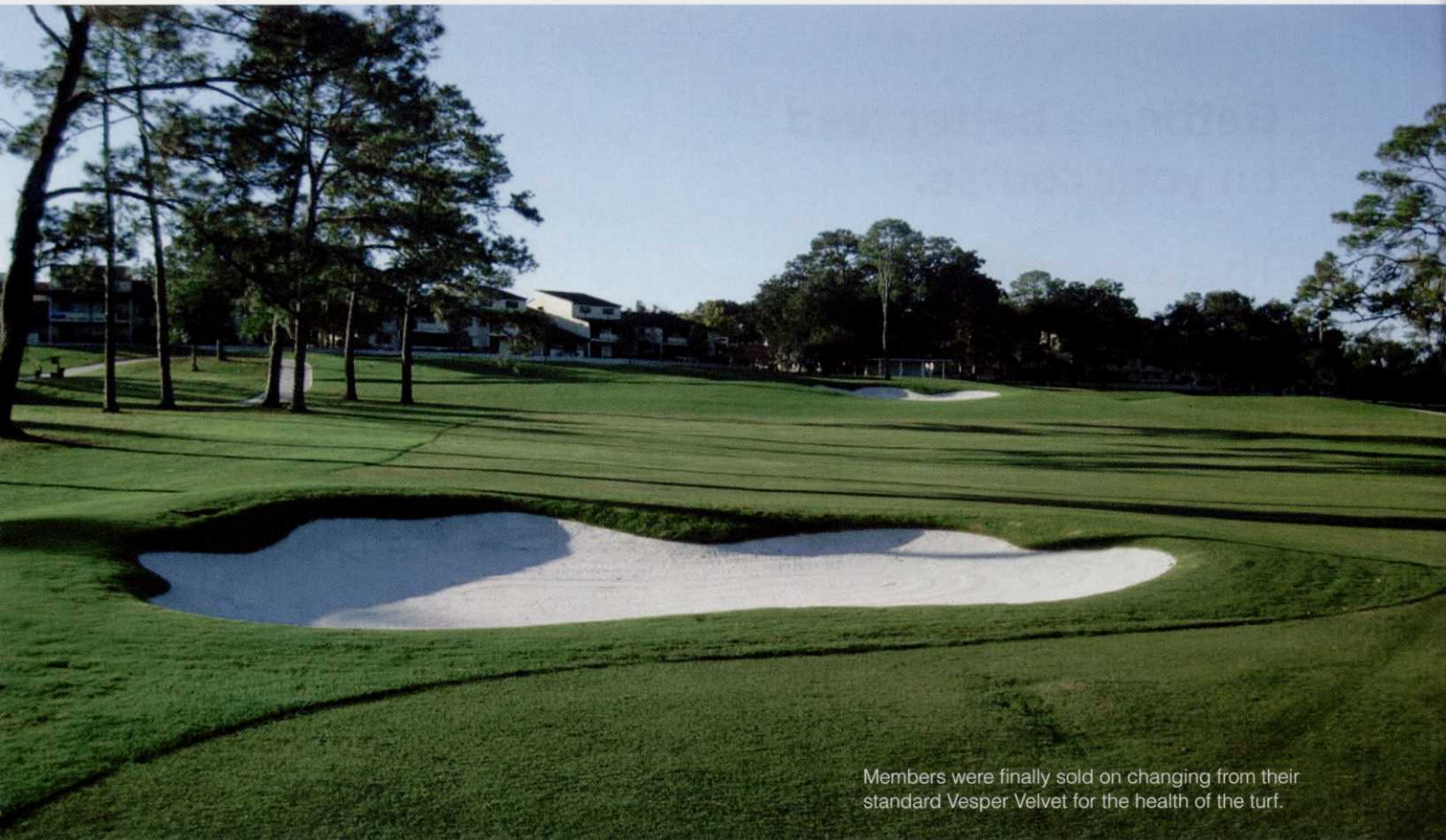
Members were finally sold on changing from their standard Vesper Velvet for the health of the turf.