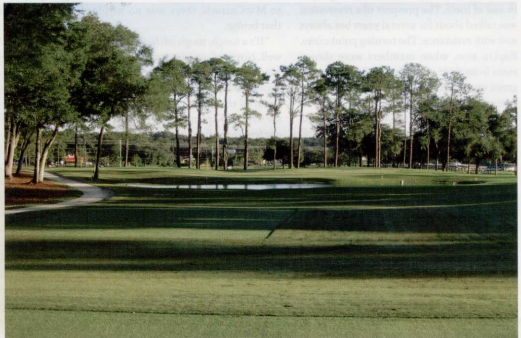
Facing a deadline of 62 days, preparation was the most important step of the renovation.

Vesper Country Club has roots back as far as 1875 and was a charter member when the Massachusetts Golf Association organized in 1903. The club hosted the first Massachusetts Open Golf Championship two years later and it is a high point of pride for the club that the inaugural