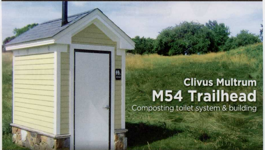
Clivus Multrum M54 Trailhead Composting toilet system & building