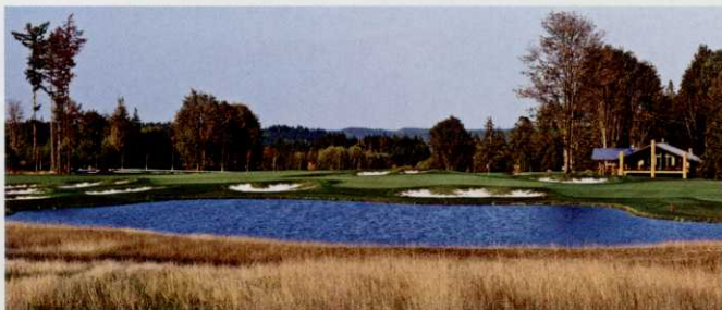
Water isn’t just a hazard for players. Proper drainage ensures that it stays in the feature and off the course.

“The materials used aren’t typical of drainage work usually