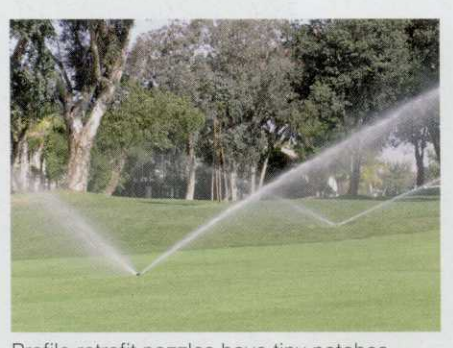
Profile retrofit nozzles have tiny notches pressed into the nozzle face along the stainless steel insert. The notches strip away a small amount of water from the main stream, dropping it closer to the sprinkler head, spreading the stream more uniformly.

Before installing the Profile nozzles, he ran the irrigation system for extra minutes to green up the course. Now he has shortened run times for a more efficient schedule and has implemented "cycle and soak" programs