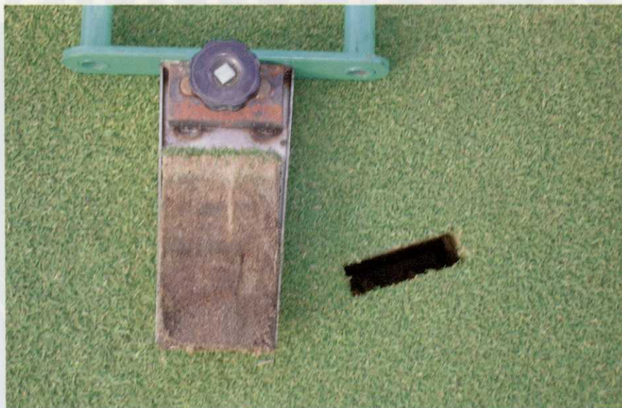
A sand green root-zone after multiple heavy topdressings.

High content or straight sand greens suf-