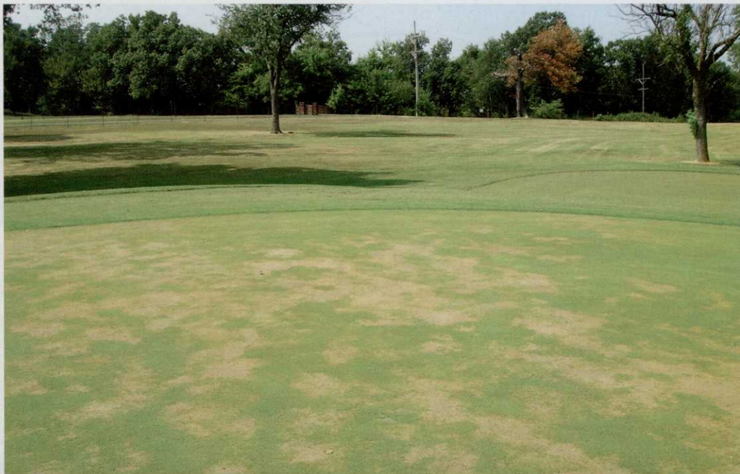
Left: Aerification remains the single most important cultural practice for a functional root-zone. Right: A dead green. High organic matter in upper three inches of root-zone caused turf to decline and die.

stress above 86 F. Bentgrass root death occurs after five days of 90 F temperatures.