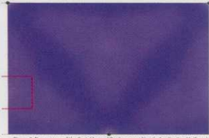
Figure 2. Diagram of the Sprinkler and Replacement Nozzle Application Uniformity

Top: Figure #1, wet areas with plastic heads. Figure #2, with stainless steel heads.