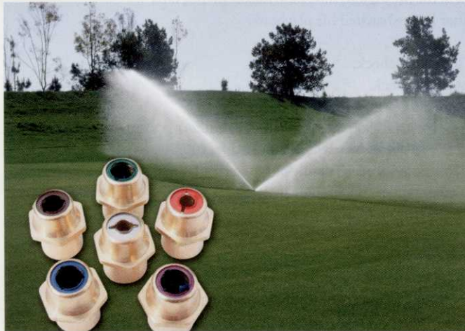
Top: Donut damage. Superintendent Dennis Eichner says you can place your hand over the stainless steel nozzle's spray pattern and see the uniform coverage.

there is a specific tool designed to resolve DU issues.