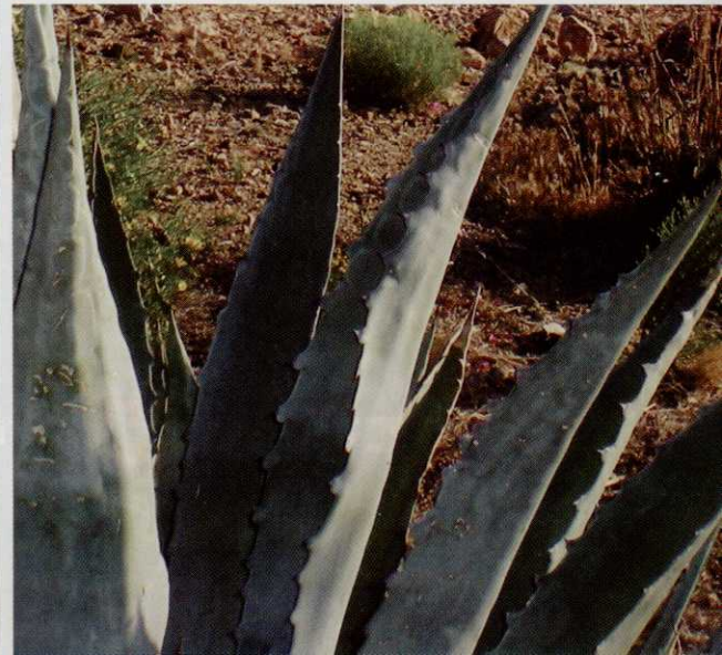
RED ROCK COUNTRY CLUB