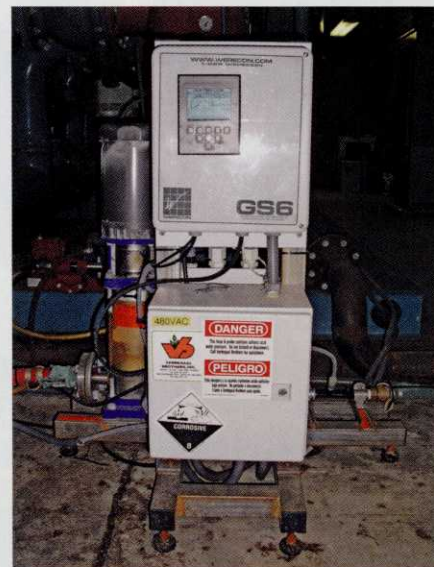
The Wereco computerized pumping system Red Rock installed. This system utilizes a vacuum technology to eliminate the delivery of sulfuric acid at high pressures into the irrigation system.

The second approach Swanson applied was the use of a synthetic acid, settling on applying and spraying applications of Aquatrols Burst Turf wall-to-wall biweekly. Burst is strictly