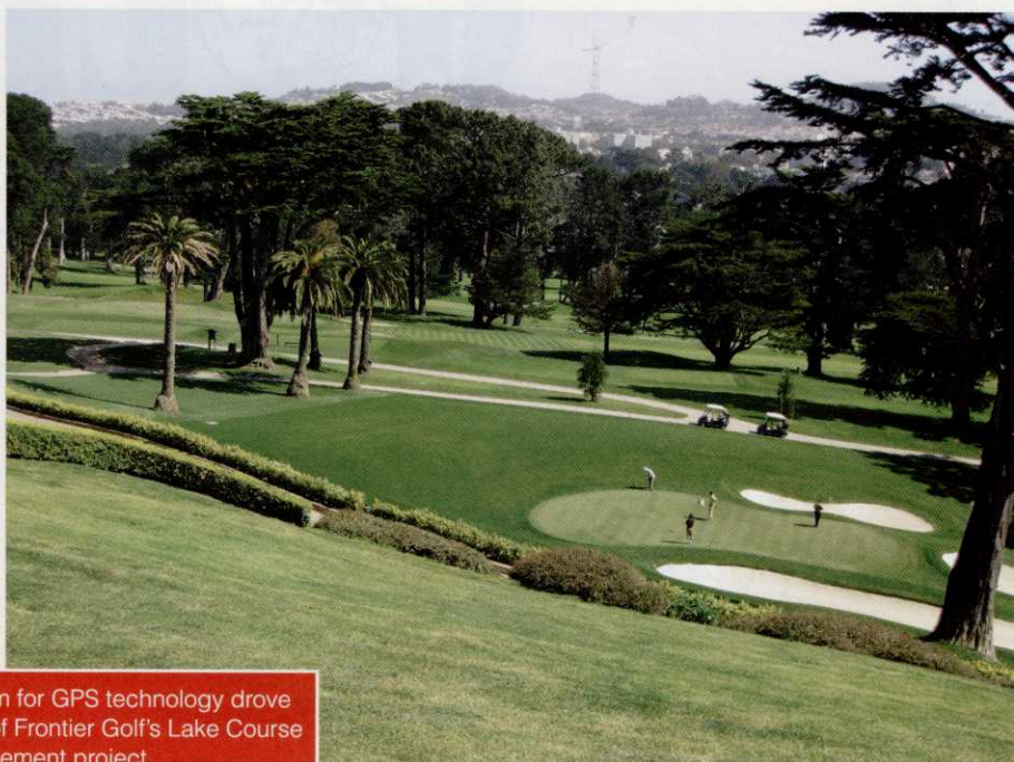
An enthusiasm for GPS technology drove the success of Frontier Golf's Lake Course greens replacement project.