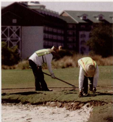
Barona Creek removed about two acres of turf from its golf course during the first phase of its turf reduction program.

ing to tees and roughs, lowering maintenance requirements by an additional 10 to 15 percent. These measures will address several important environmental issues, ranging from reduced fuel and energy consumption to the use of fewer fertilizers and chemicals used for maintenance.