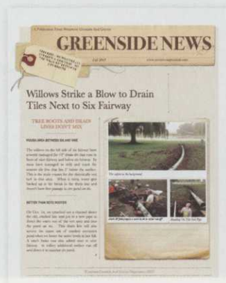
Westmoor Country Club publishes Greenside News and posts hard copies in the club house and a digital version online.