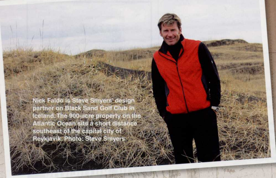
Nick Faldo is Steve Smyers' design partner on Black Sand Golf Club in Iceland. The 900-acre property on the Atlantic Ocean sits a short distance southeast of the capital city of Reykjavik.