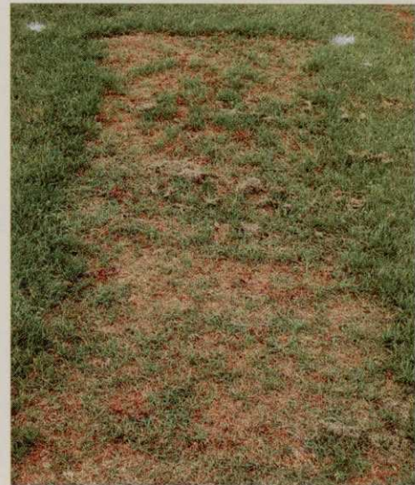
Clumpy perennial ryegrass treated with Revolver plus 1 percent volume to volume methylated seed oil.

fescue ( Schedonorus phoenix ) aren't completely controlled. Both species can become chlorotic when treated with Revolver under low temperature conditions, but after three to four weeks, injury subsides and weeds recover. Unexpected low temperature swings in the spring or fall could potentially induce decreased activity in sulfonylurea herbicides.