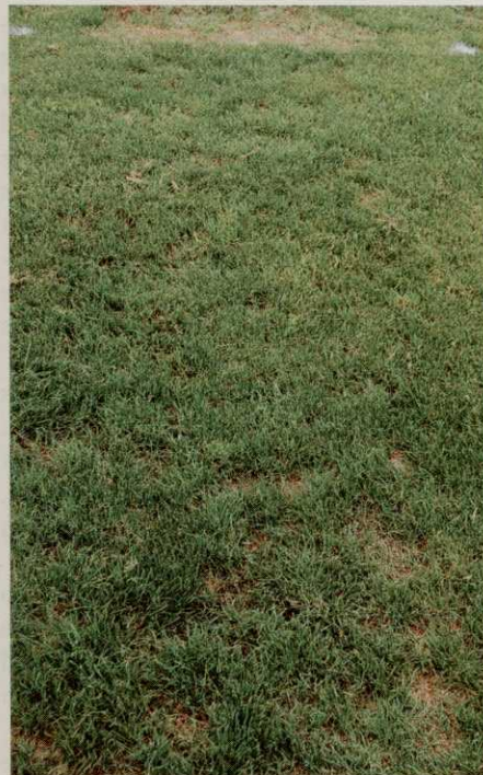
Clumpy perennial ryegrass treated with Revolver alone.