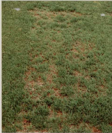
Clumpy perennial ryegrass treated with Revolver plus 4 pounds of ammonium sulfate per acre.