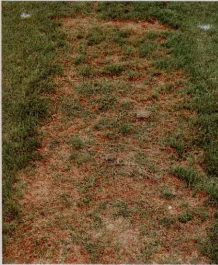
Clumpy perennial ryegrass treated with Revolver plus 4 pounds of ammonium sulfate plus 1 percent methylated seed oil.