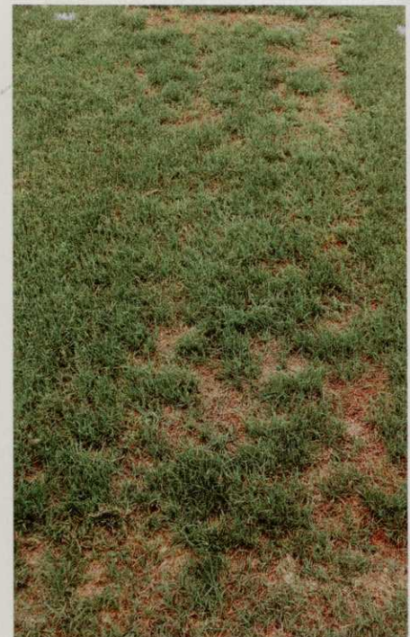
Clumpy perennial ryegrass treated with Revolver plus 2 pounds of ammonium sulfate per acre.