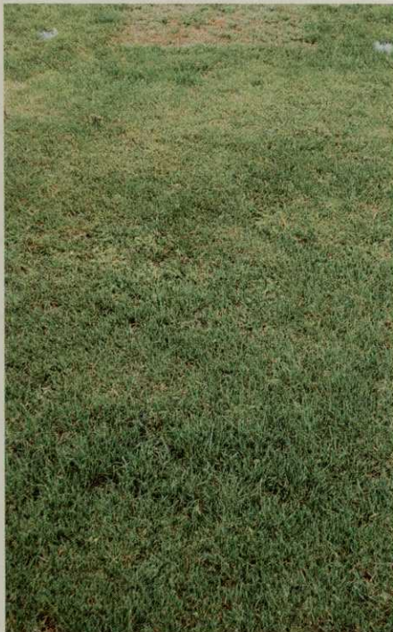
Nontreated clumpy perennial ryegrass.

The weather has become something more than just a conversation starter. With global warming, El Niño and the threat of superhurricanes,