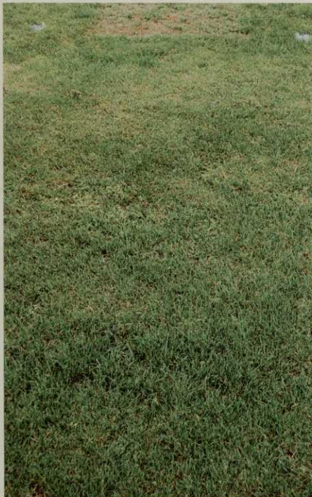
Nontreated clumpy perennial ryegrass.

The weather has become something more than just a conversation starter. With global warming, El Niño and the threat of superhurricanes,