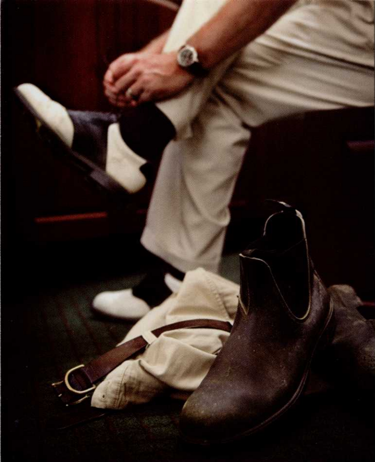
Nathan Migal, Imagen Photography