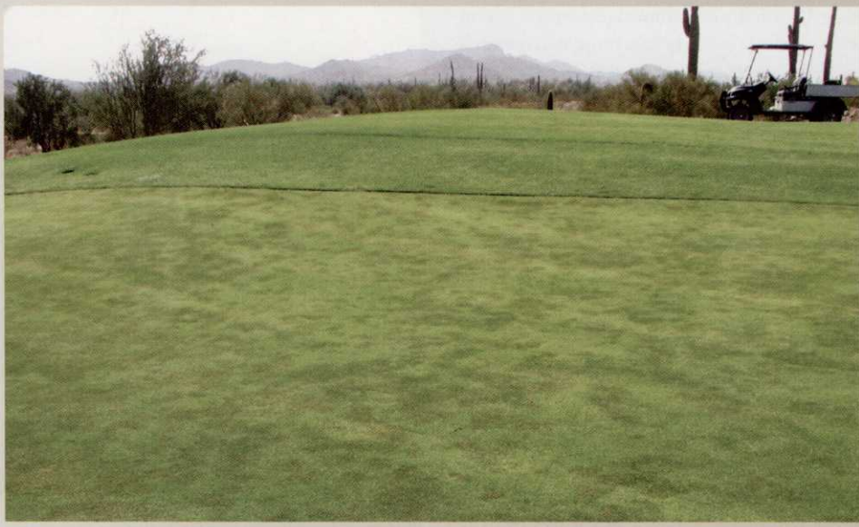
Rapid blight occurs during the fall and winter, affecting ryegrass, annual bluegrass and Poa trivialis, shown here.