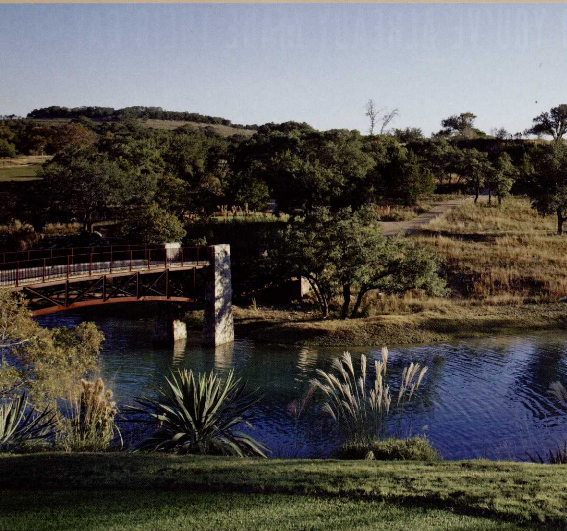
Weather station use at Spanish Oaks can save between $5,000 and $15,000 annually.

“For me, I sleep better at the end of the day when I put together something based on the information we have,” Semm says.