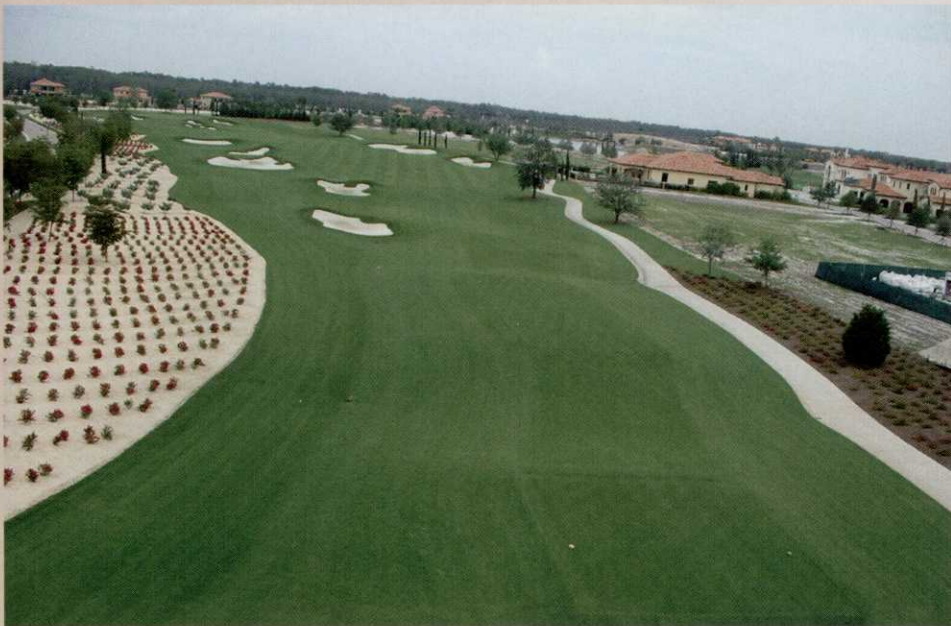
Even though Tuscany Reserve in Florida is experiencing drought conditions lately, the color of the seashore paspalum is hanging in there.