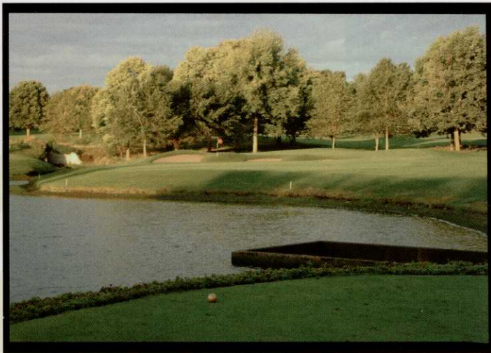
Instead of having a golf committee and a green committee, the Des Moines Golf and Country Club has one committee for golf, green and grounds.