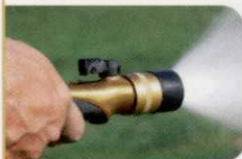
Patented Precision™ nozzle fogs to deliver a 25 ft. pattern with only 4-6 GPM.

Designed for the single purpose of cooling the turf canopy without over watering (which risks damage to the roots). And the 25 foot pattern gets the job done quickly.