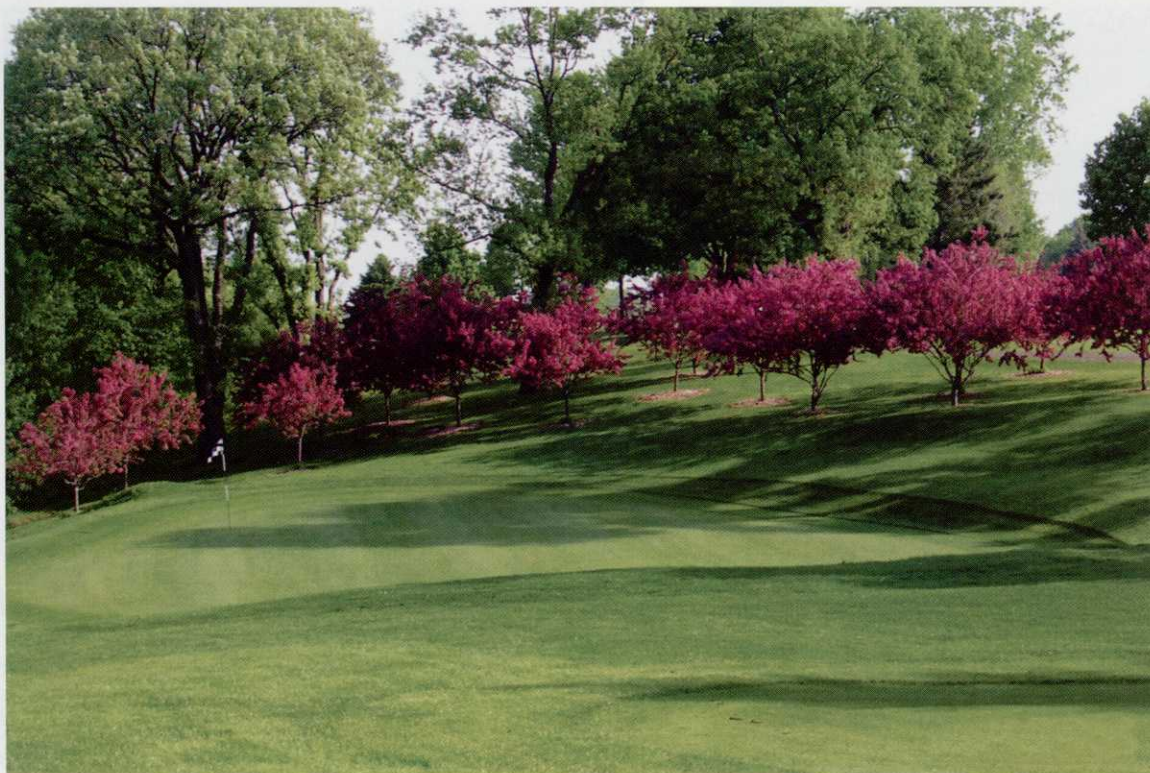
At Keller Golf Course, Paul Diegnau, CGCS, spends between $1,500 and $2,000 on accessories annually.

"We always have fresh flags every year," he says. "We also paint the flagsticks every year, unless they're too beat up, in which case we replace them."