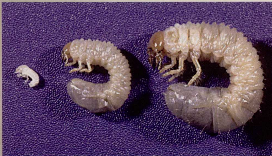
First, second and third instar grubs. The first and second instar larvae are most susceptible to curative controls.

The impact of a preventive program on the spectrum of secondary target pests occurring at