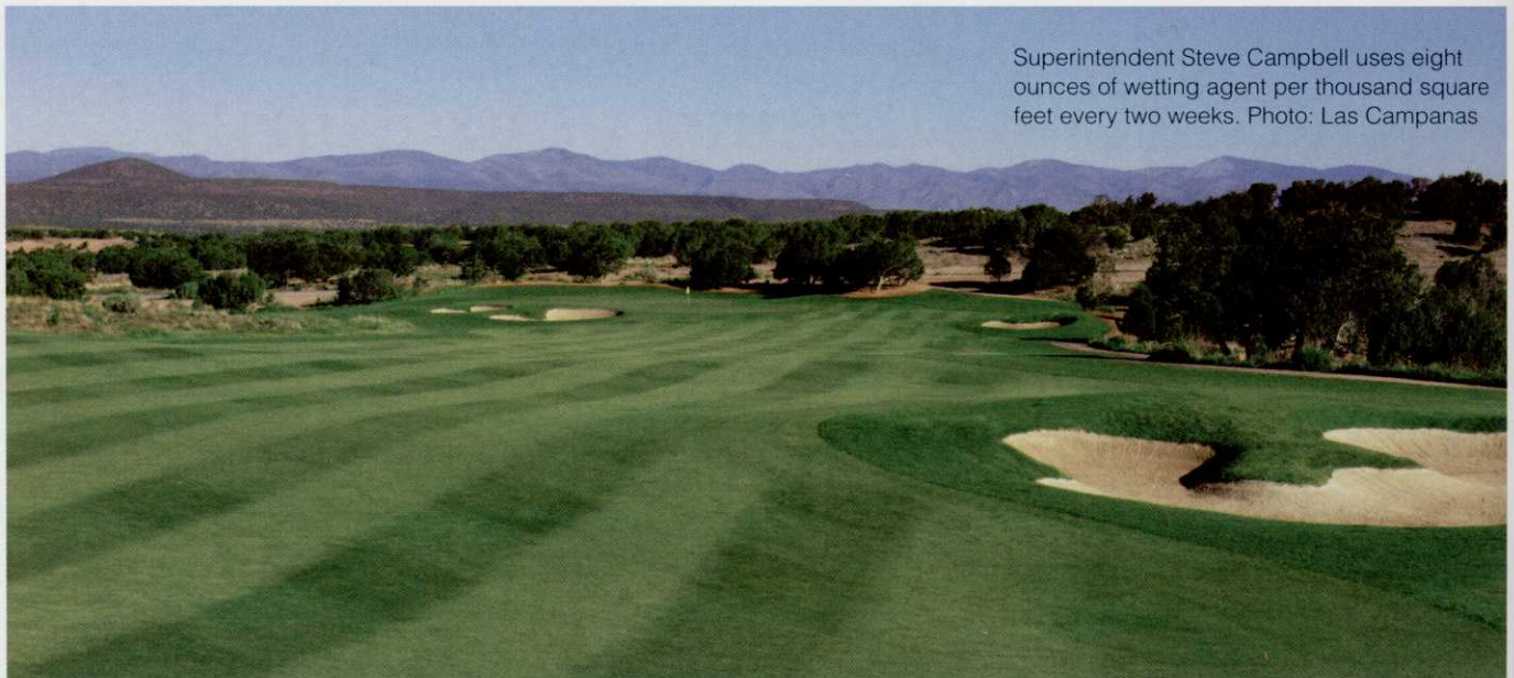
Superintendent Steve Campbell uses eight ounces of wetting agent per thousand square feet every two weeks.

Under water conservation mandates, the most water Campbell can use per golf course per day is 600,000 gallons, even though he says he can use less than that during less stressful months of the year. Determining