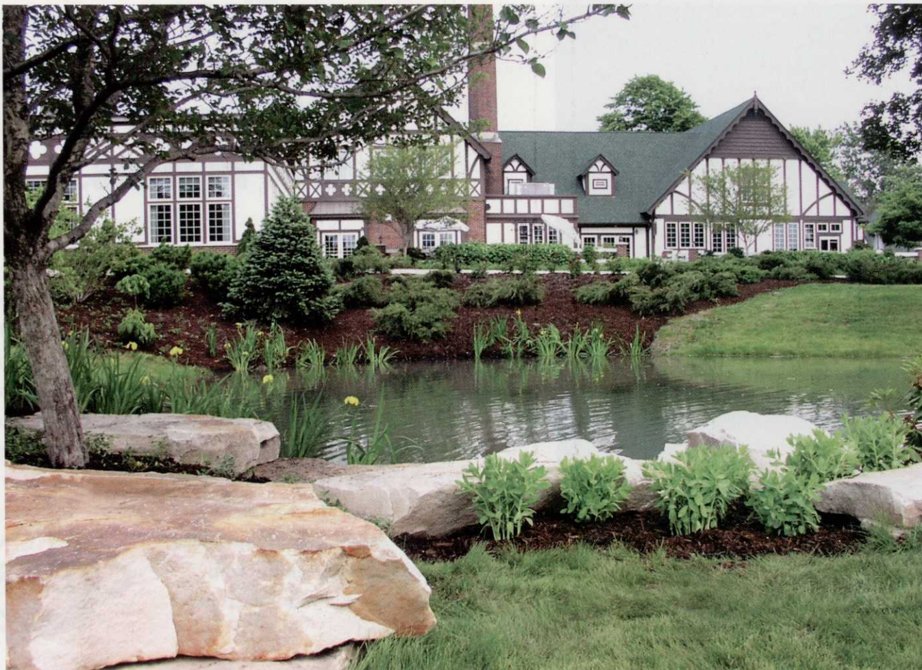
At Traditions at Chevy Chase, rounds are limited to 30,000 a year because the city and course management don't want the course to be rundown.