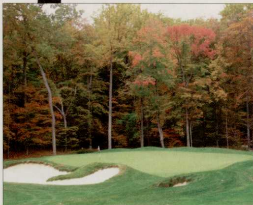
The Golf Course at Glen Mills is located on the campus of a correctional facility. Photos: The Golf Course at Glen Mills

For more information, visit www.glenmillsgolf.com . — Heather Wood