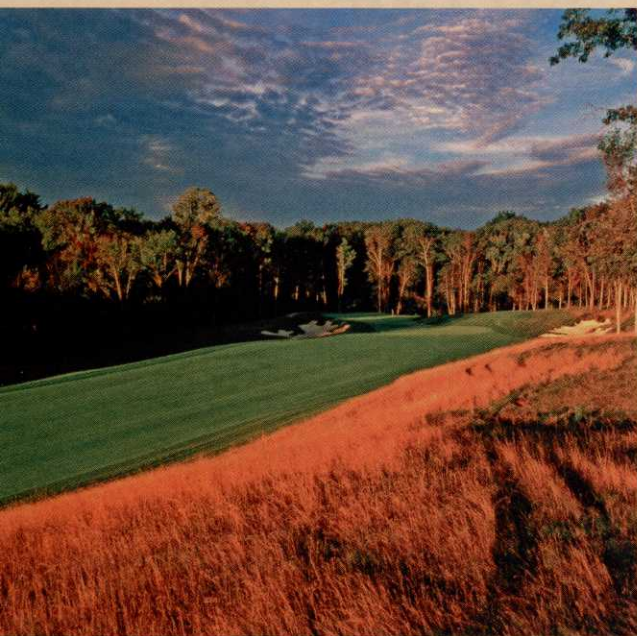
The Highlands Course is set amid a hardwood forest and offers vistas stretching toward the Hudson River.