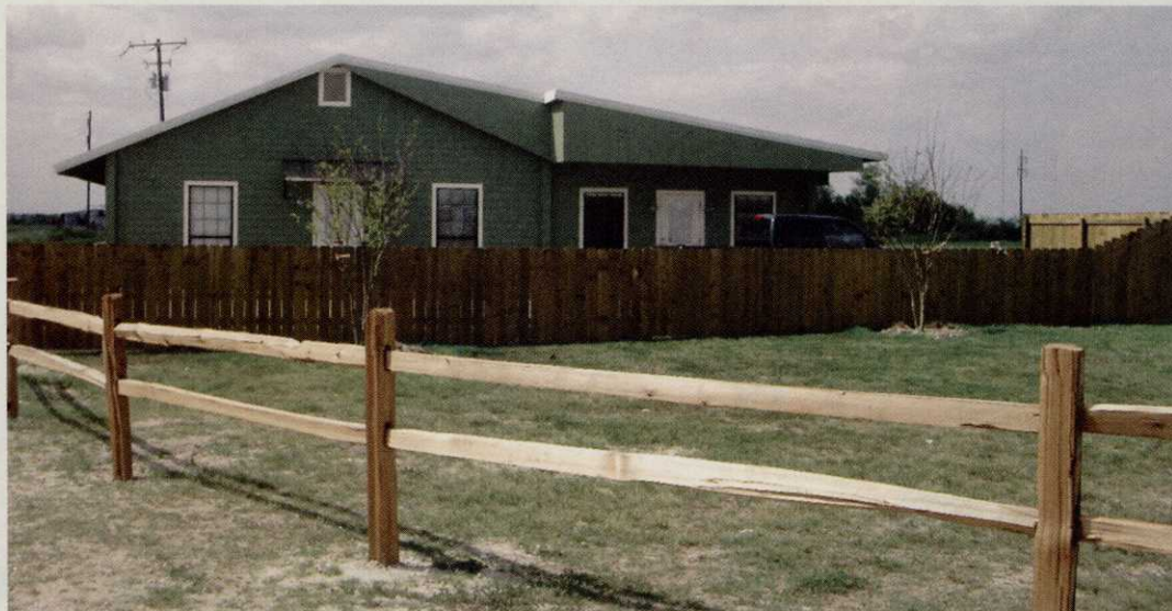
The Island in Plaquemine, La., provides housing for the guest workers it hires through the H-2B program.

program already from counting toward that 66,000 cap. Immigration reform legislation is under consideration by Congress again, and the temporary, seasonal work force is part of the overall picture. Thus, labor and immigration are two of the GCSAA's priority issues.