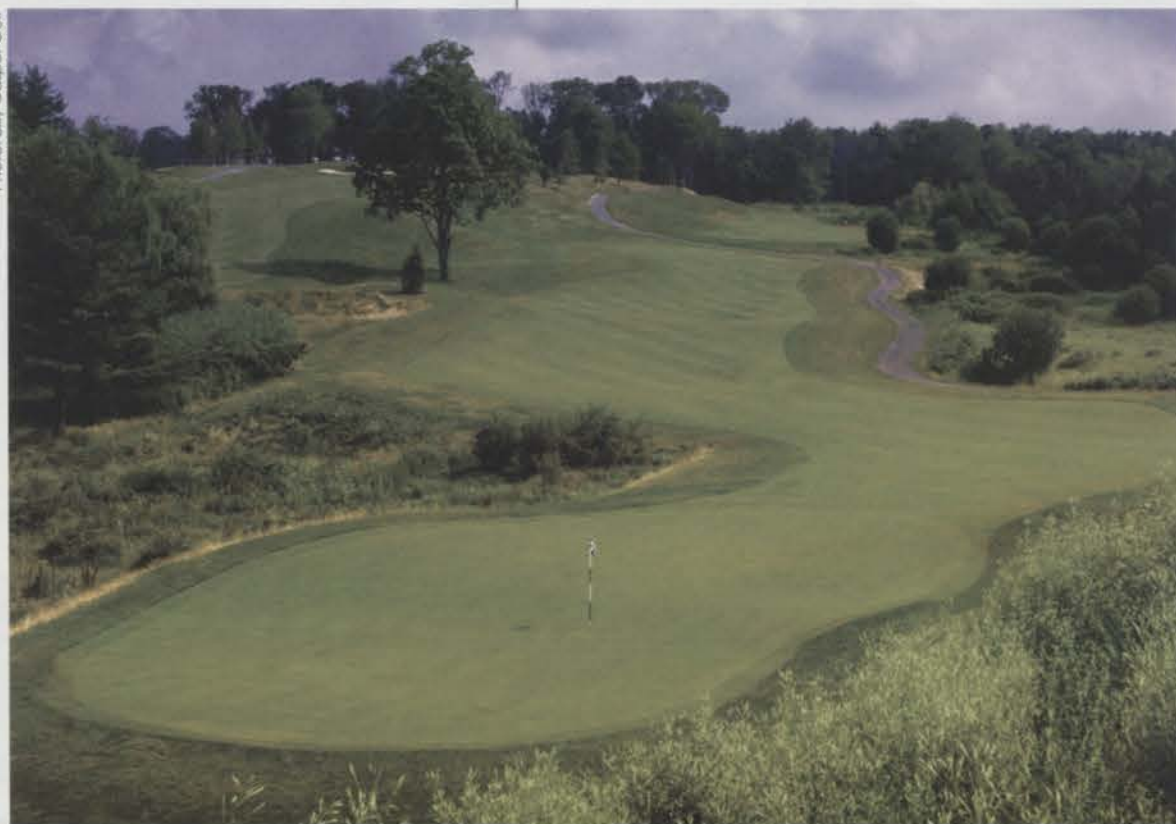
The staff at Hudson Hills Golf Course sometimes helps out at neighboring Maple Moor Golf Course in Westchester County, New York. The two staffs also share equipment.