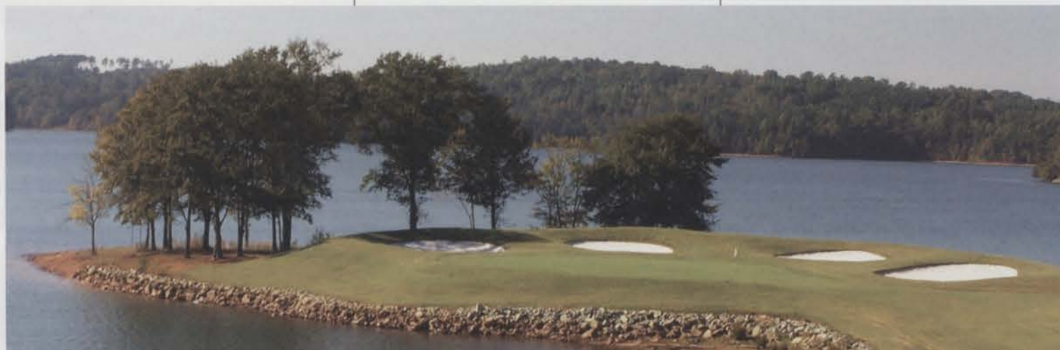
The Walker Golf Course near the campus of Clemson University serves as a living laboratory for many fields of study associated with the school.