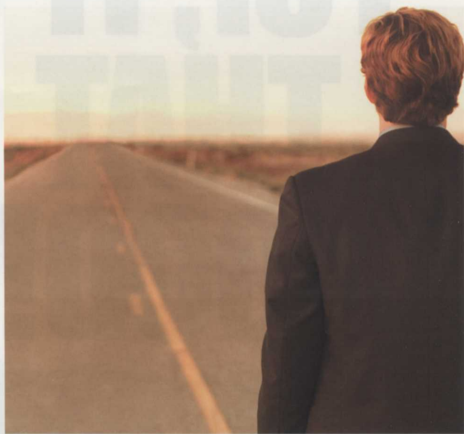
Assistant golf course superintendents are creating more opportunities for themselves by serving on their local chapter associations' boards, albeit as nonvoting members.