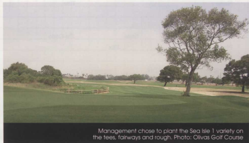
Management chose to plant the Sea Isle 1 variety on the tees, fairways and rough.