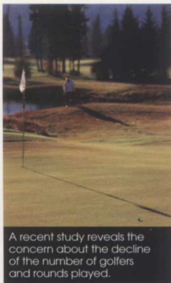
A recent study reveals the concern about the decline of the number of golfers and rounds played.