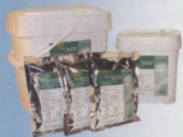
The Landscaper's Companion®