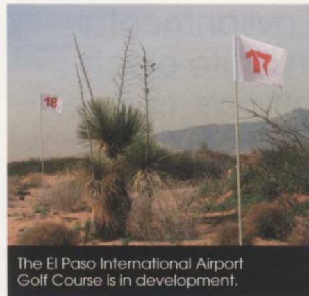
The El Paso International Airport Golf Course is in development.

El Paso, Texas – Tom Fazio was in El Paso for the groundbreaking ceremony of the El Paso International Airport Golf Course project in February. The project is part of the first phase of the development of El Paso's first resort hotel.