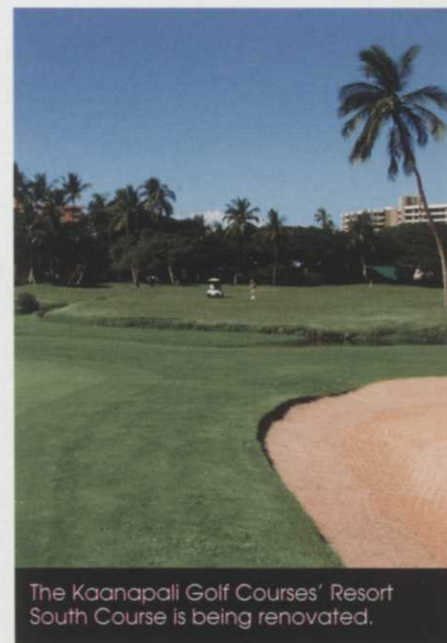
The Kaanapali Golf Courses' Resort South Course is being renovated.