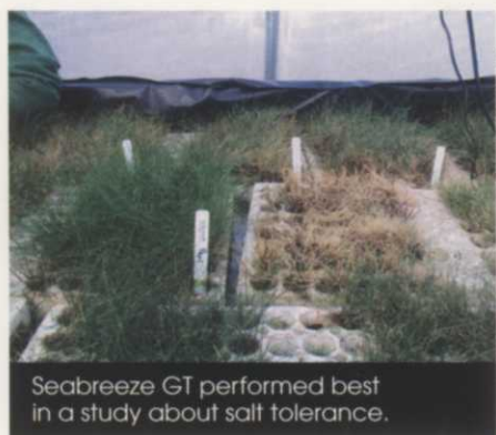
Seabreeze GT performed best in a study about salt tolerance.

Hubbard, Ore. – One of Turf-Seed's slender creeping fescue varieties, Seabreeze GT, demonstrated the best survival rate among commercial varieties in a three-month study in which the varieties were exposed to salt levels of 10,000 ppm of