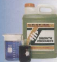
Iron Max AC 6%