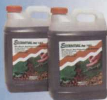
Essential® Plus 1-0-1