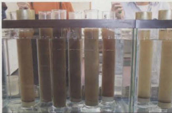
Soil physical properties include the relationship of solid, liquid and gaseous phases in the soil.

Soil bulk density is a property routinely measured that has a profound affect on other physical properties. The density is the dry weight per unit volume of soil and is an indicator of soil compaction. The higher the num-