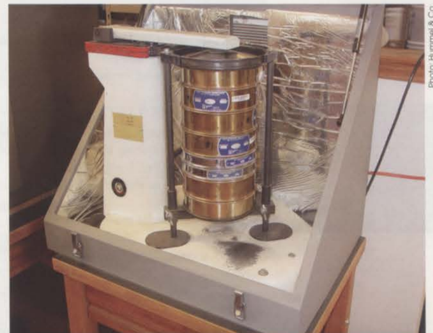
When soils are tested, it's important that the distribution of air and water filled pores are determined because they relate to soil health.