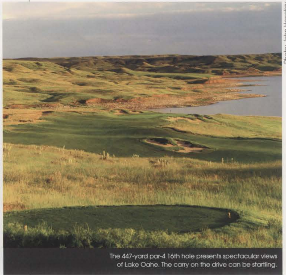
The 447-yard par-4 16th hole presents spectacular views of Lake Oahe. The carry on the drive can be startling.

Whether the developer needs to do the major pre-planning for design-build depends on the client, Kubly adds. "Many clients need to know the absolute cost. But for Sutton Bay we had a very good idea. We budgeted everything. We always had a