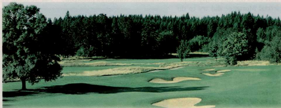
Pumpkin Ridge Golf Club in North Plains, Ore., was one of the 253 courses involved in the NGP transaction.