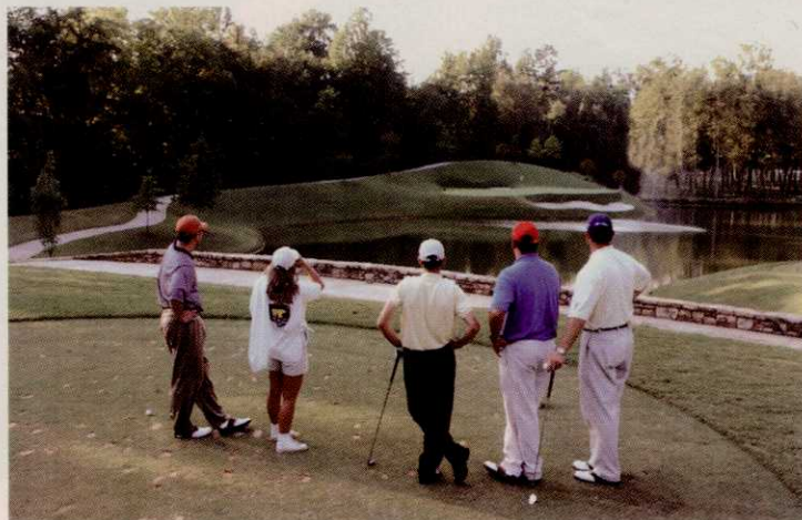
In addition to being a draw for golf purists, the forecaddies at ClubCorp's Bear's Best in Atlanta and Las Vegas have helped the courses speed up play.

found that an antiquated service instituted at the clubs has helped address this age-old problem. Through forecaddie programs, the courses have been