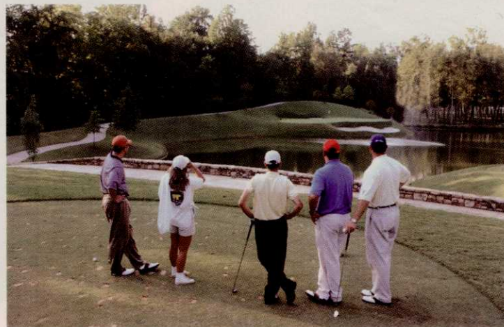
In addition to being a draw for golf purists, the forecaddies at ClubCorp's Bear's Best in Atlanta and Las Vegas have helped the courses speed up play.

found that an antiquated service instituted at the clubs has helped address this age-old problem. Through forecaddie programs, the courses have been