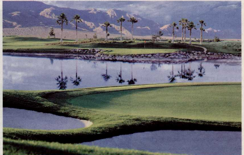
Meadowbrook Golf's Silverstone Golf Club in Las Vegas took top honors in the premium daily-fee facility category of the NGF's CLASP Awards.

ilities to confidentially share and compare key financial and operations data with other local, regional and national operators. NGF members can access the