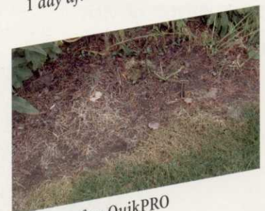
5 days after QuikPRO