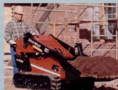
Ditch Witch's SK500 mini skid steer in action.

Ditch Witch is ready with its new SK500 mini skid steer, a compact walk-behind model that is designed for a variety of construction applications. The machine is powered by a 24-hp Honda engine, travels on rubber tracks powered by dual independent hydrostatic ground drives and has lifting capacity in the 500-pound weight class. The SK500 can be configured as a material loader, trencher, augering machine, forklift and