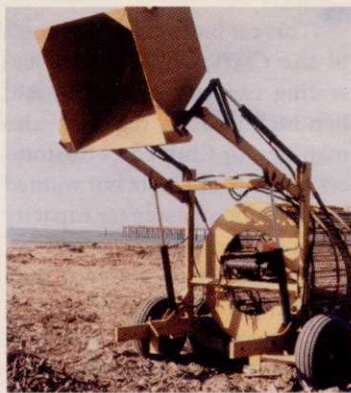
The Hi-Lift can move one ton per minute

Glenmac's Harley Model B Hi-Lift is ideal for large capacity stone removal. The maneuverable units can screen items from one half inch to 18 inches in diameter. The Hi-Dump model raises to eight feet high and has a one cubic yard box and the Side Delivery Elevator elevates to 10 feet high. Both are capable of moving one ton per minute. The units require a 35- to 75-hp tractor with PTO drive and a hydraulic system running at 11