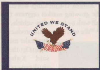
One of the new Patriot Series flag designs

Lesco has introduced a new Patriot Series golf flag allowing courses to show their patriotic spirit during national holidays. Lesco is donating 15 percent of all sales of these flags to the USO.