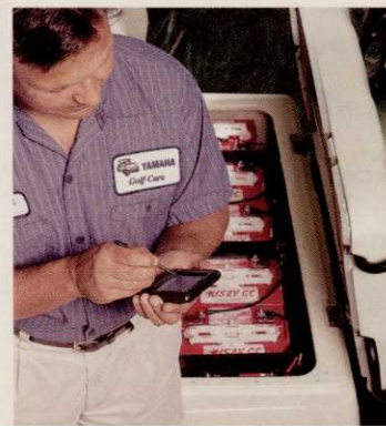
Yamaha has introduced its Genius diagnostic system, which allows courses to configure their golf cars with a Palm Pilot.

will take back golf cars coming off lease and send them through