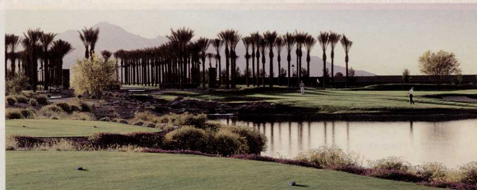
OB Sports recently opened The Duke at Rancho El Dorado, one of 14 courses the company manages.