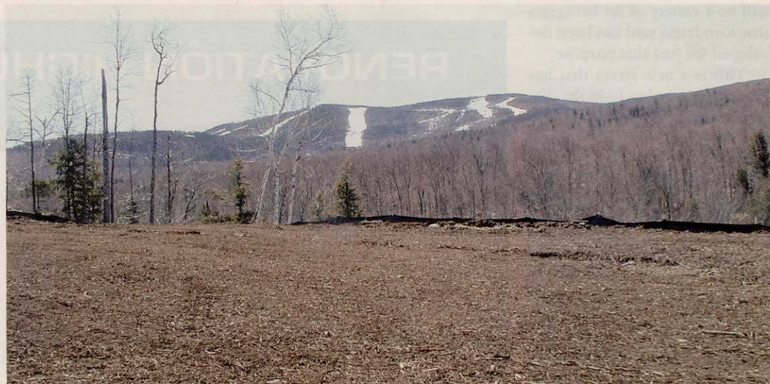
Harris Golf has commenced construction at Sunday River Golf Club, which promises to offer views of the surrounding mountains.