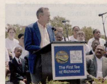
The First Tee honorary chairman, former president George Bush, recently helped celebrate the organization's 100th facility, in Richmond, Va.