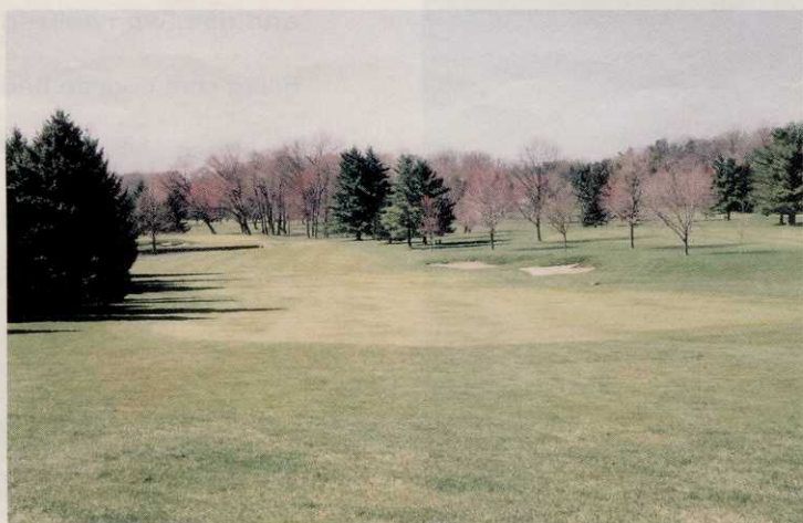
This summer, Waynesboro CC will replace turf on its fairways to help fight disease.